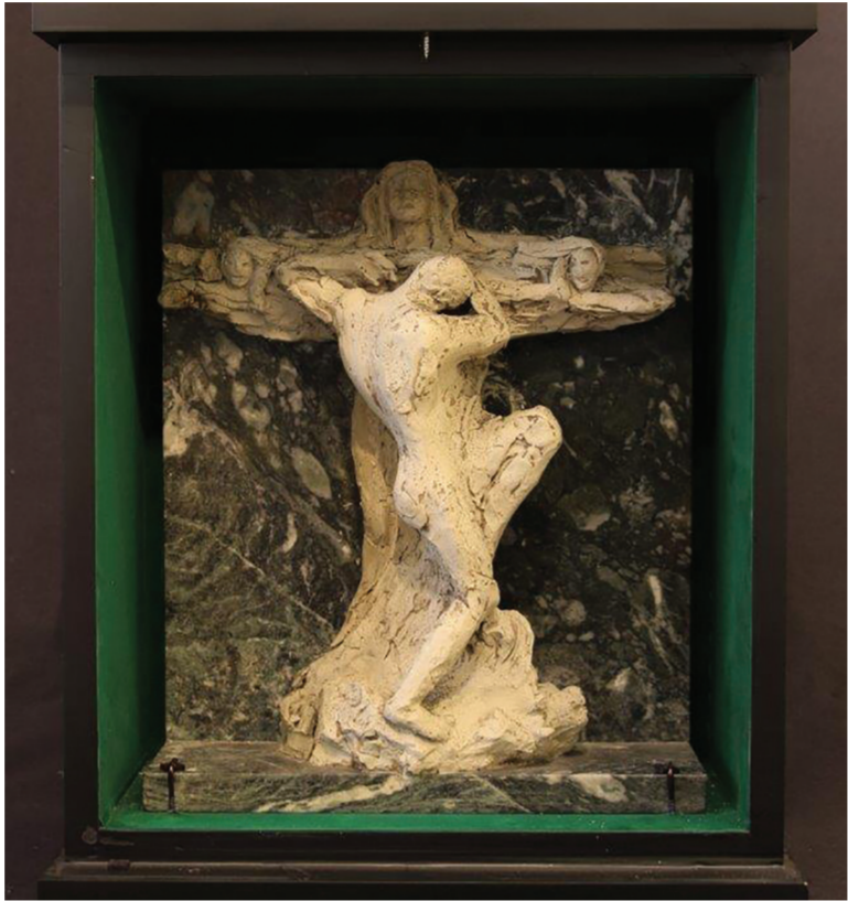
The Antonio Sciortino clay bozzetto