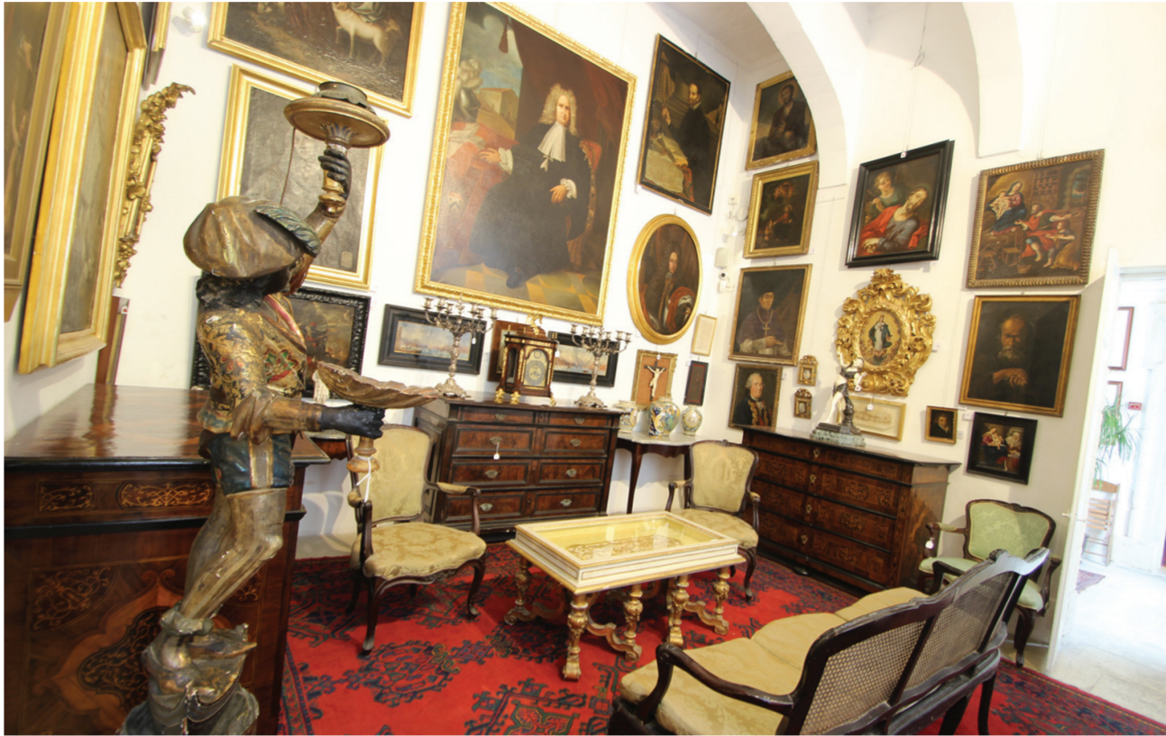
A general view of one of the rooms at Obelisk Auctions.