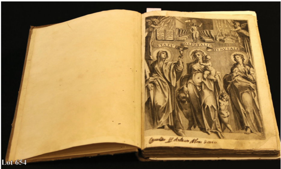
Lot 654 Statva Hospitalis Hiervsalem, 1788